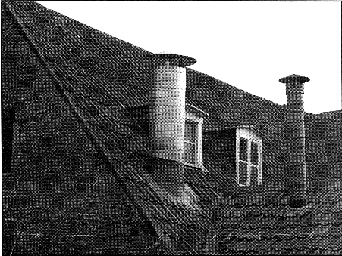
Photograph attached for identification purposes only and to read in connection with schedule 2 (i).